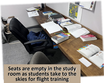
Seats are empty in the study room as students take to the skies for flight training