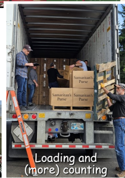
Loading and (more) counting