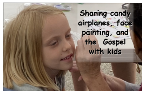
Sharing candy airplanes, face painting, and the Gospel with kids