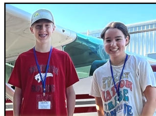
Camper's ready to take to the skies in Cessna 172, N5363K.

Summer camp continues to be a labor of love at MATA as the program continues to impact kids for the Kingdom. Our recent camp saw 18 teens introduced to flight and mission aviation. The campers received staff devotionals each morning and missionary testimonies and teachings each evening led by Gary Elliott . The week's activities culminated in the planning and execution of a cross-country flight to 3 different airports in the Puget Sound area. Many smiles and "stories of adventure" capped off the week's experience for the kids. For more information see: mata-usa.org/top-menu-activities-aviation-summer-camp/