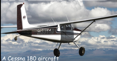
A Cessna 180 aircraft

The M.J. Murdock Charitable Trust is considering MATA’s request for matching funds to help purchase a Cessna 170/180 for a total project cost of $175,000. This plane will serve as a high performance, tail-wheel training aircraft which additionally would help deepen MATA’s impact in its Alaskan ministry. Thus far, a generous MATA donor has contributed $42,000 toward a match of $87,500. An additional $45,500 is still needed. Would you pray about and consider a gift to help us acquire this airplane? Please contact us to learn more or visit www.mata-usa.org/donate to donate. Thank you!