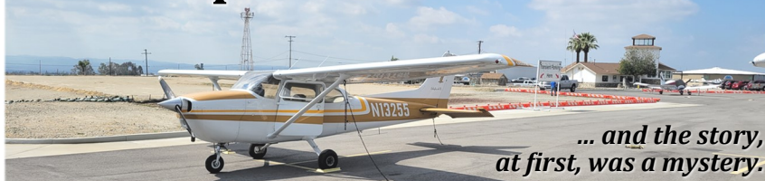
... and the story, at first, was a mystery.