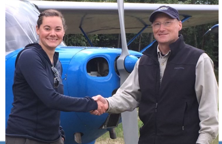
Private Pilot · July 8 TH