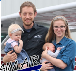
The BOOKMAN FAMILY to Kenya, Africa

PMA Bringing Hope, Changing Lives www.pmapacific.org