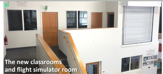
The new classrooms and flight simulator room

After months of work which included planning, fund raising ( thank you so much, once again! ), and "tearing down and building up," we are happy to announce the completion of our new classrooms and office space at MATA. These rooms were immediately put to work for flight instruction and I.T. purposes (see below). Please continue to pray for "more workers" as MATA staff (along with students) have transitioned forward to serve on the mission field.