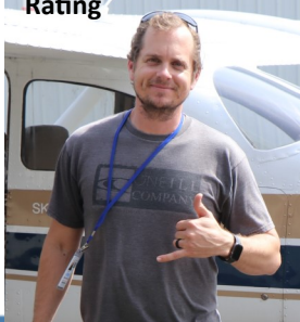
Instrument · Apr 29 TH Rating