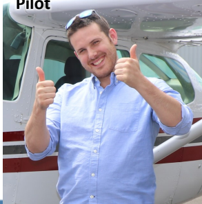
Commercial · May 12 TH Pilot