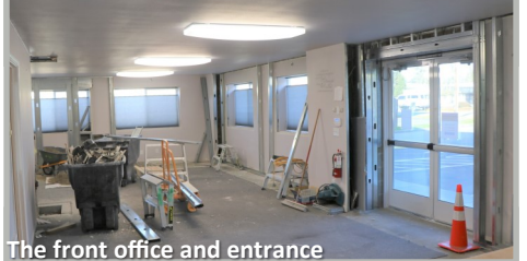
The front office and entrance

A humble “thank you!” to everyone who contributed toward this project. We are excited about this expansion project which will increase our potential for training and sending more pilots to the mission field in the future!