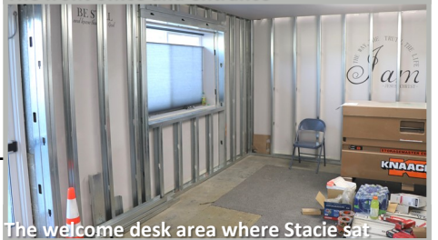
The welcome desk area where Stacie sat