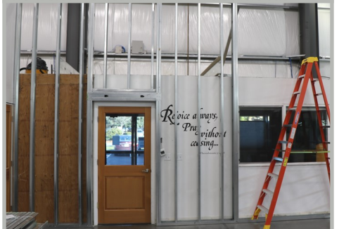
Classrooms being constructed over front office