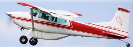
Chief pilot, Gary Elliott, on the first flight!

N300HP, a Cessna A185F, flew over 14,000 hours as a MAF missionary plane in Indonesia. The two brothers who now own the plane (former MKs in Indonesia whose dad flew this very plane) loaned the plane to MATA to be used for high-performance, tailwheel training. Before the training could begin, MATA maintenance performed an Annual Inspection and took care of a number squawks and heavy maintenance items, to include refurbishing the main landing gear springs. After months of work the plane made its first flight on Sept. 15th! Flight students were eager to begin training in it. Whether at MATA or on the mission field, maintenance work is a behind-the-scenes service which allows mission pilots to fly safely in their ministry. The next big project before the maintenance team is working on an on-loan Cessna 310 which will be used for multi-engine training.