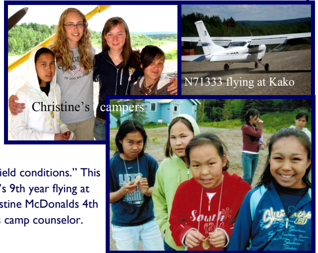
Camp produces smiling faces