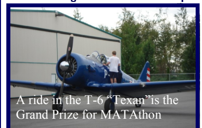
A ride in the T-6 "Texan" is the Grand Prize for MATathon

Saturday June 4th is MATA's 10th annual MATathon fundraiser, where a 6-mile run around the airport trail produces funds for our Alaska ministry. Support MATA's ministry to Alaska through the enclosed envelope.